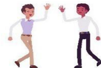
The 10-6 Rule