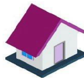
Own Your Zone