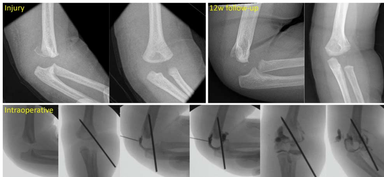
FIGURE 2. Example of a pediatric patient below 1 year of age with a transphyseal fracture resulting from suspected nonaccidental trauma. Radiographic imaging at presentation to the emergency department illustrated a fracture of the left distal humerus, primarily involving the posterior medial aspect with mild displacement and no callus formation. A true lateral view was not able to be obtained. Patient was taken to the OR for a closed reduction and percutaneous pinning. Following a successful closed reduction, a single k-wire was inserted from the lateral side to provide stability where the periosteum was torn. An arthrogram was then performed to verify the reduction (Supplemental Video 1, Supplemental Digital Content 1, http://links.lww.com/BPO/A473 ). Percutaneous pin were removed at 23 days following surgery. At 12-weeks following surgery marked healing of the transphyseal fracture was observed with near-anatomic alignment and callus remodeling observed.